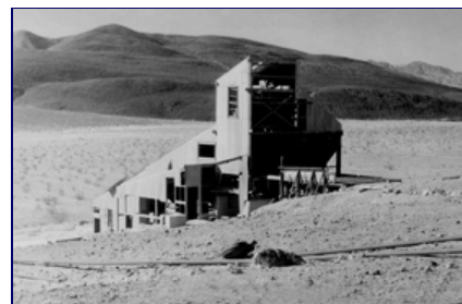
Ashford Mill in 1934, courtesy Pamona, California Public Library.

The ruins of Ashford Mill stand on the floor of Death Valley . Structures here consist of the crumbling walls of a concrete office building, and the ruins of the mill itself. Not much is left of the mill, with the exception of the large concrete foundations and a very limited amount of debris. The ruins of the mill foundation and the office building are rather interesting, and according to local legend, are due to the fact that a double load of cement was shipped to the McCauslands when construction was in progress. Rather than send it back, which would have entailed further transportation expenses, the extra cement was used in construction of the mill and office building, which largely accounts for their still standing today.