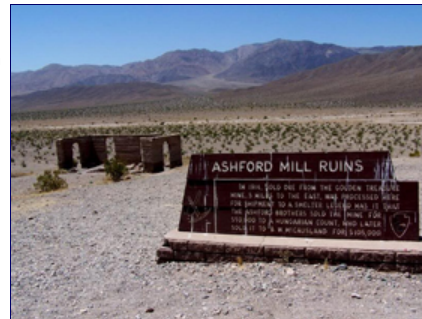
Ashford Mill ruins