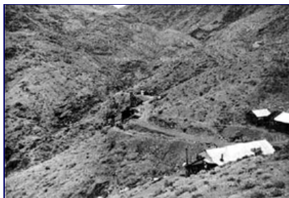
The Ashford Mine, showing the complex used in the 1930's. The cookhouse and office is in the foreground, the bunkhouses are to the right, with the head frame, collapsed tramway terminal and a shed visible in the rear.

www.google.com/chro... A free browser that lets you do more of what you like online!